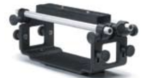
Rod Accessory kit installed on Exo-skeleton