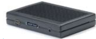
Storage Module (HDD or SSD)